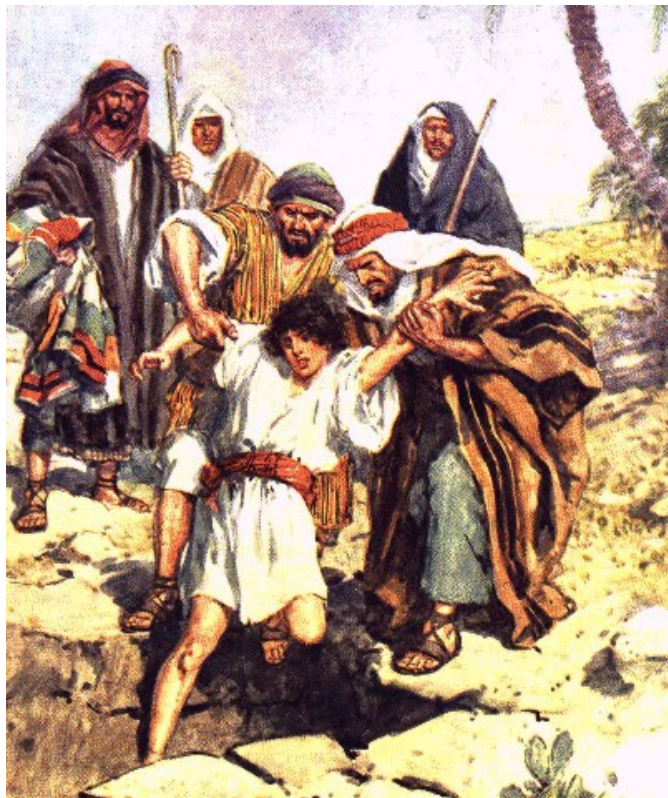
JOSEPH CAST INTO A PIT BY HIS BROTHERS (Genesis 37:24)